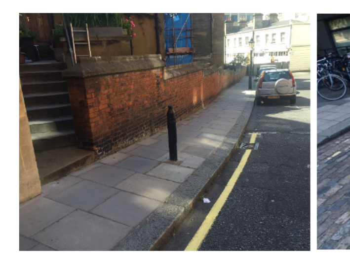
Need to deep clean pavement, Brompton Road