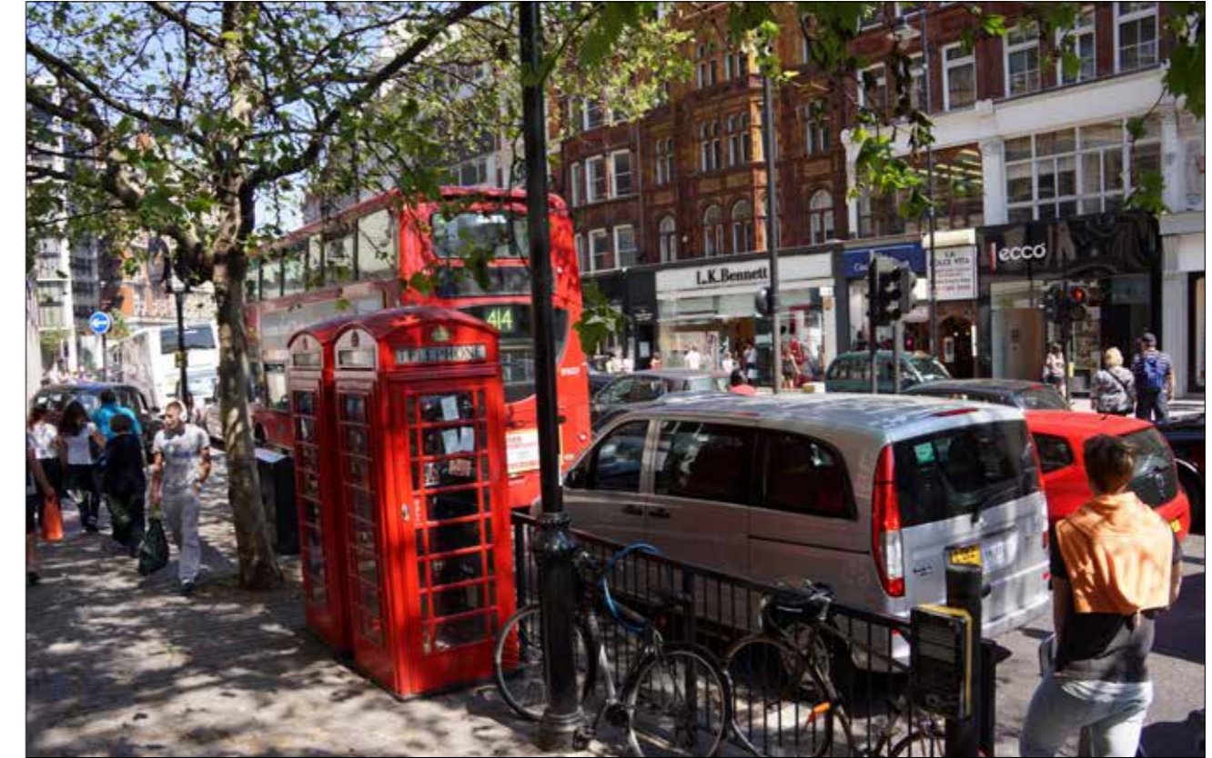
Congestion on Brompton Road