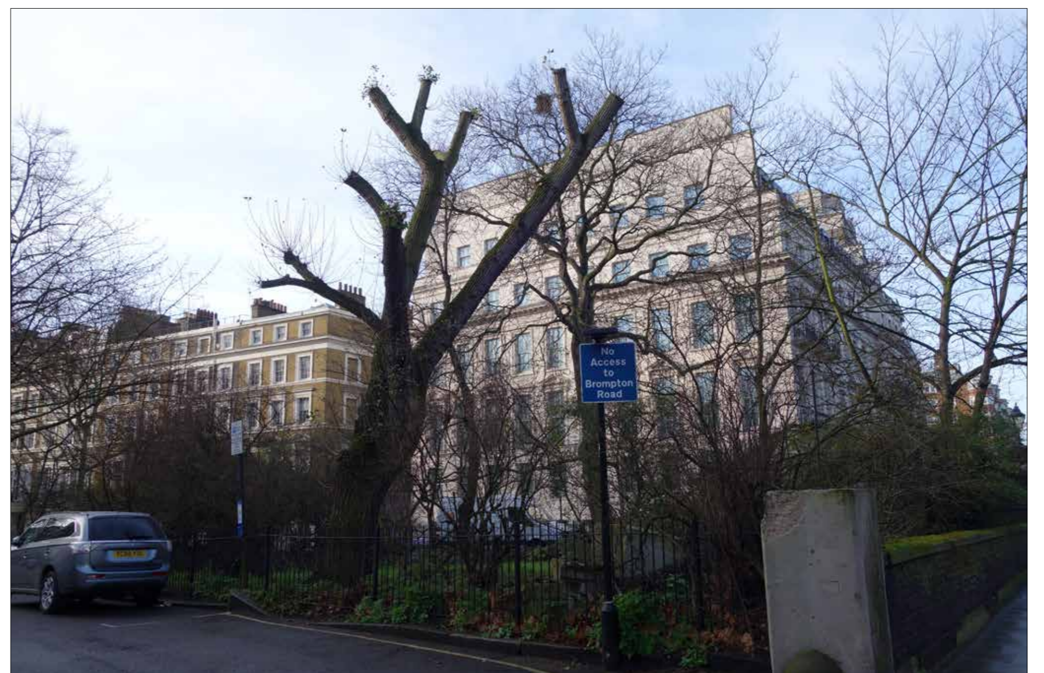
Local green space, Rutland Gate