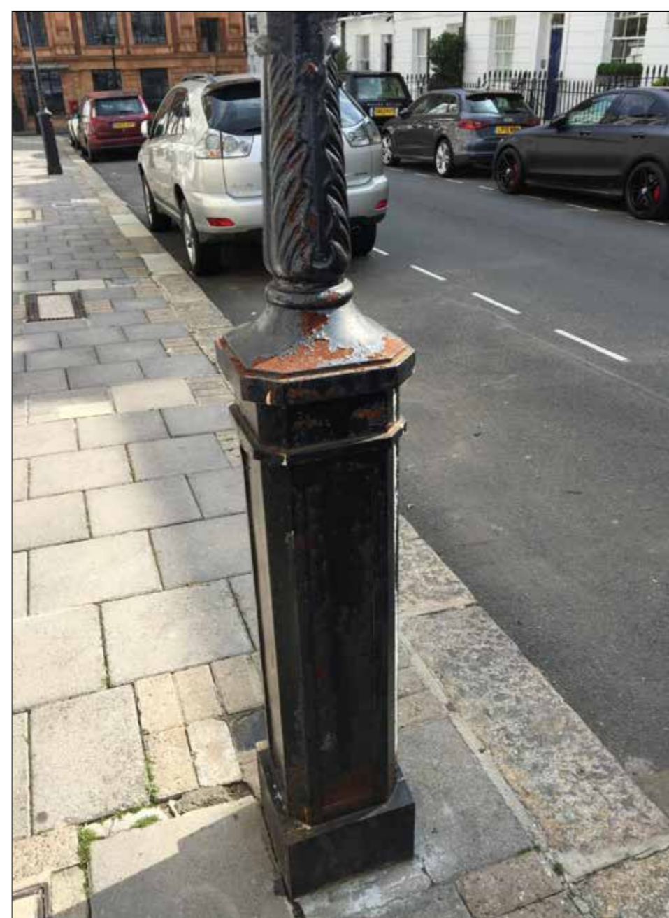
Poorly maintained street light furniture