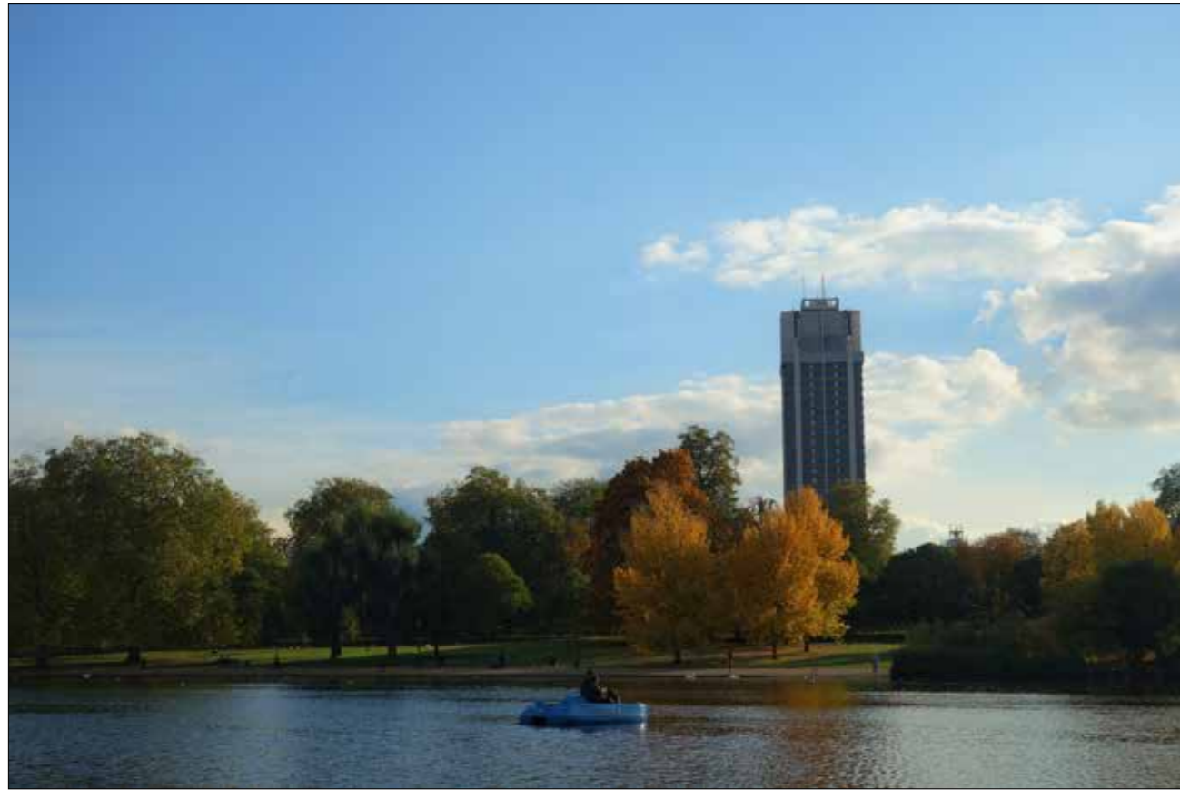
Hyde Park Quarter