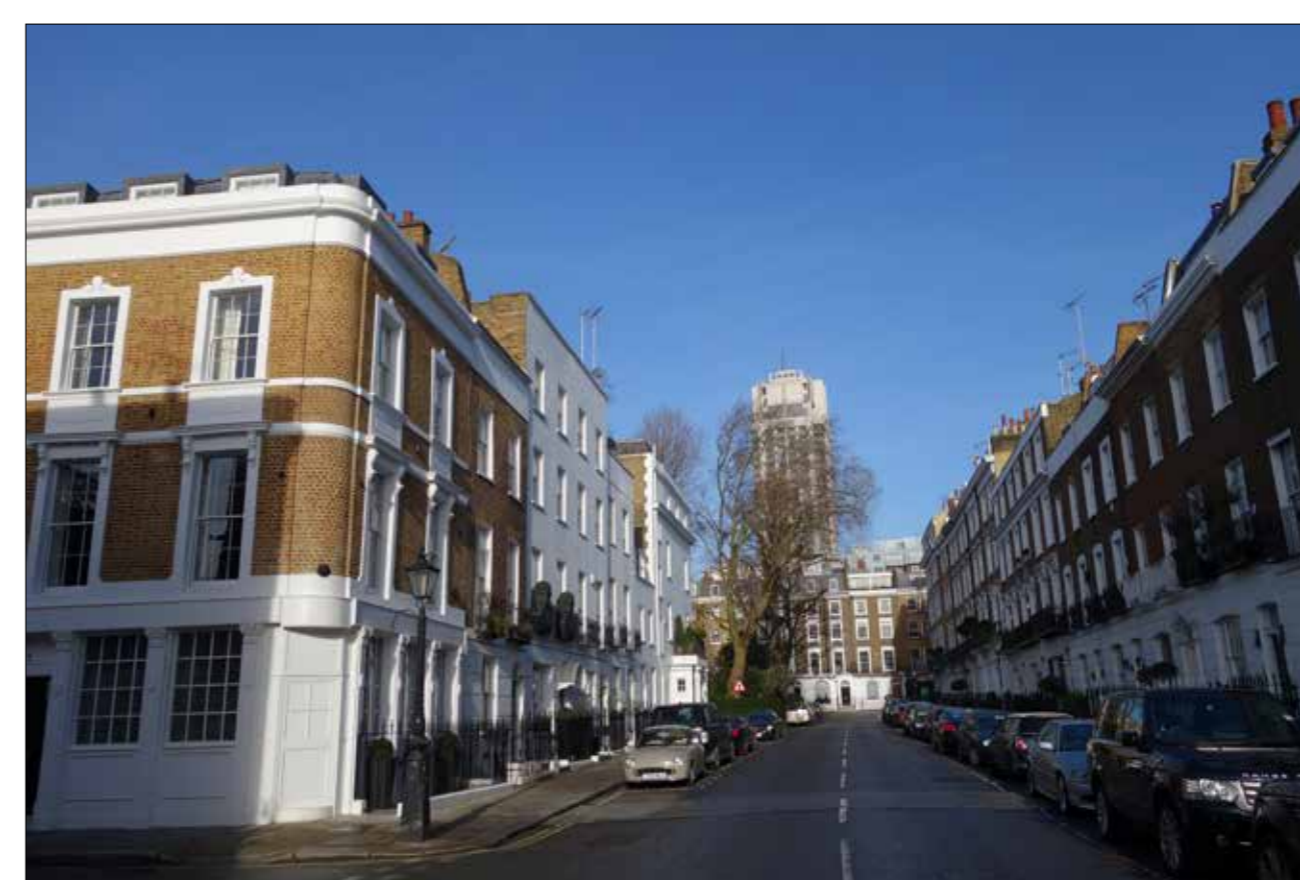
Well restored period buildings