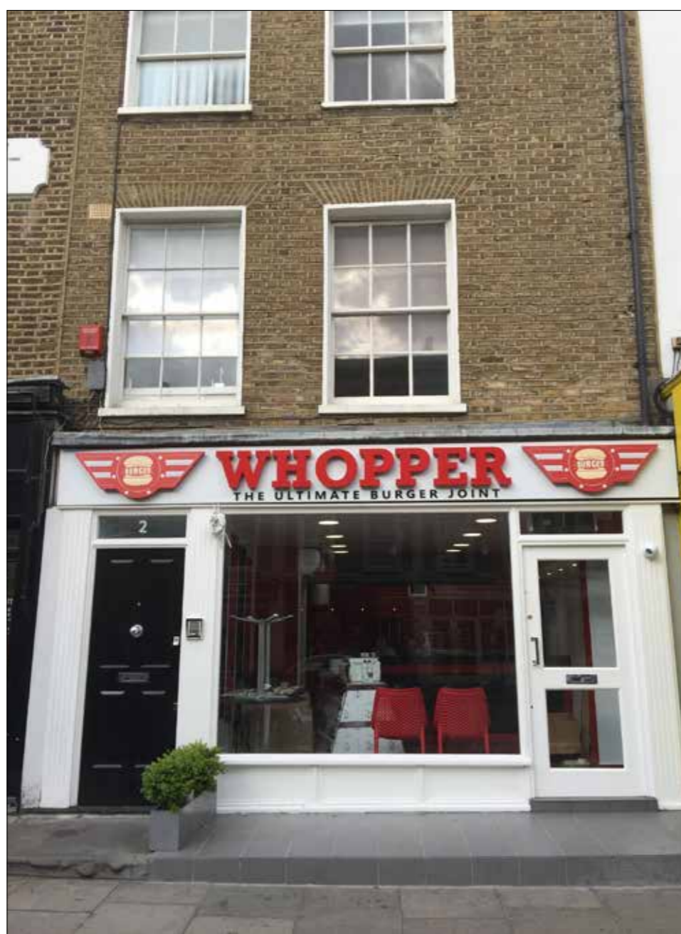
Frontage not in keeping with character