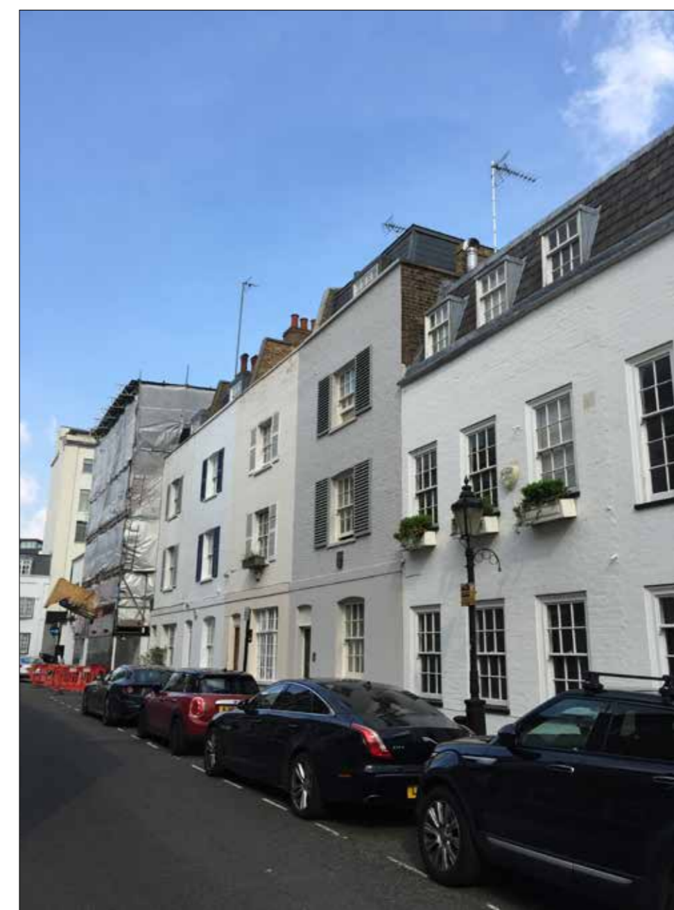
High quality decoration