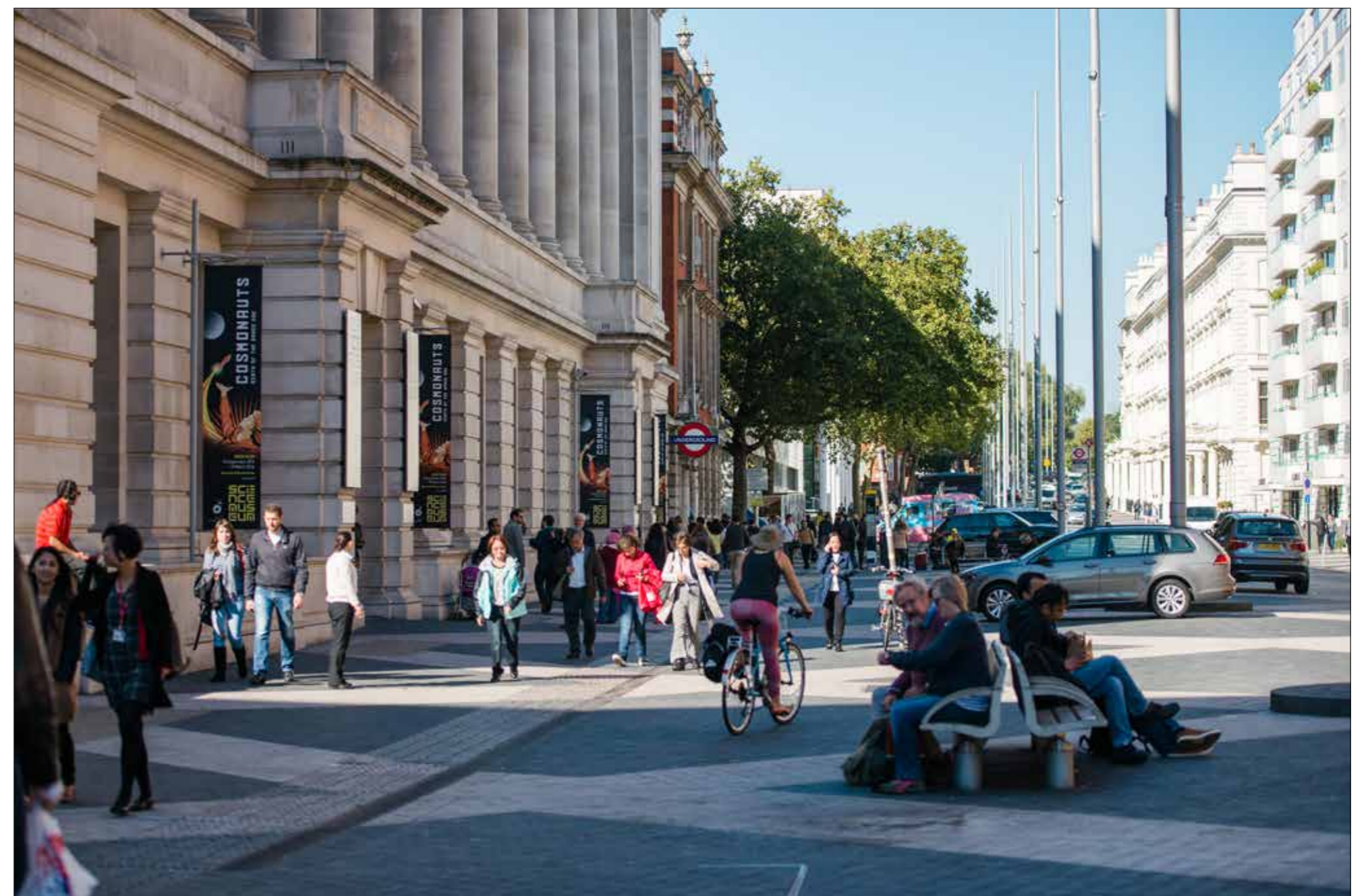
Exhibition Road shared space