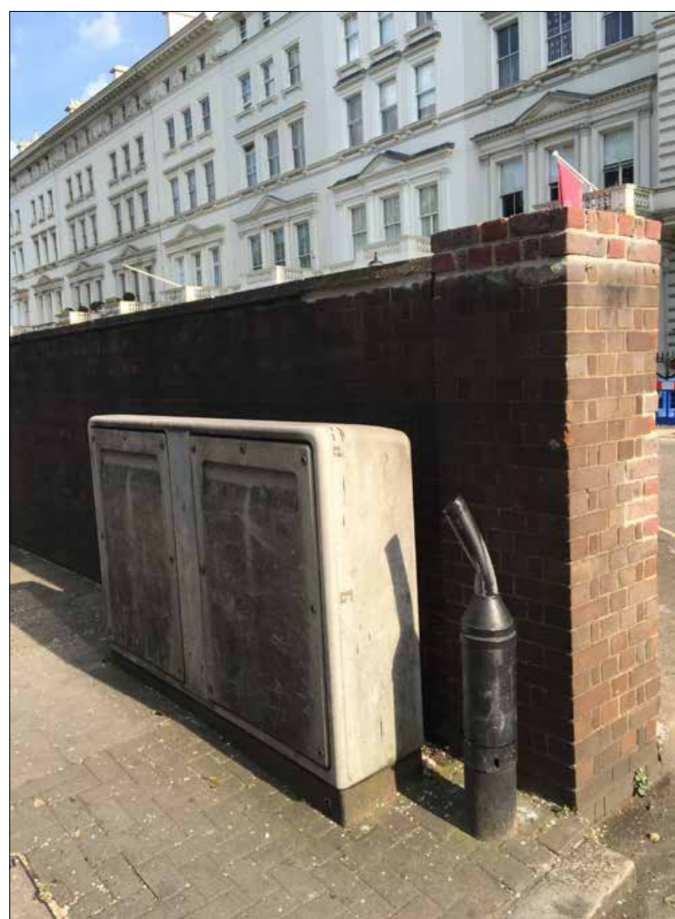
Poor appearance of electrical fittings