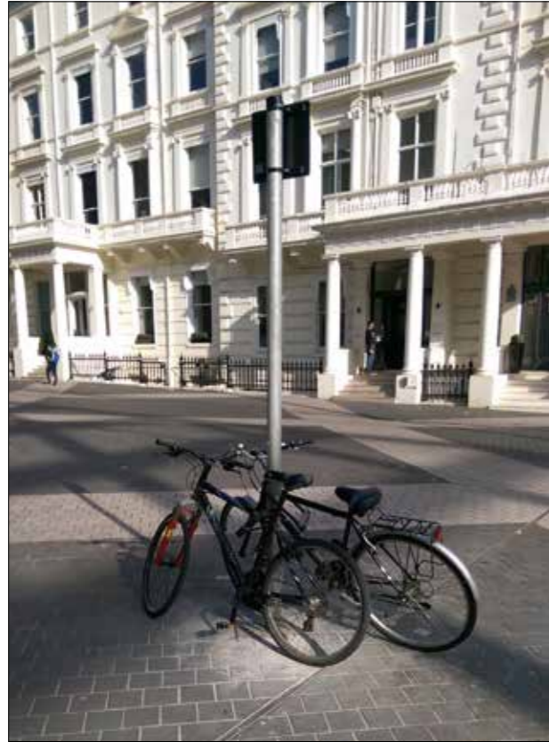
Lack of bike parking