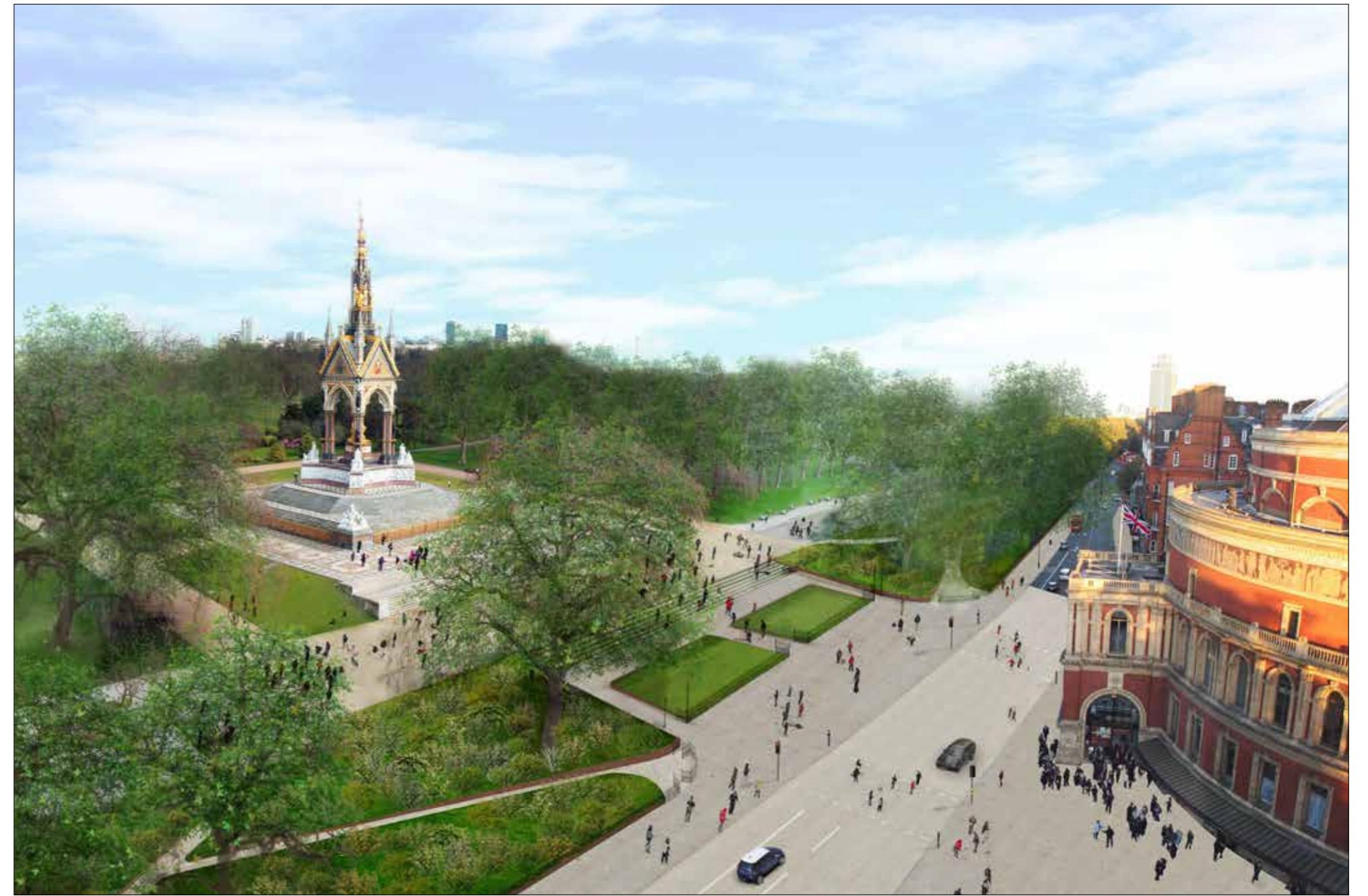
Re-imagining Albertopolis