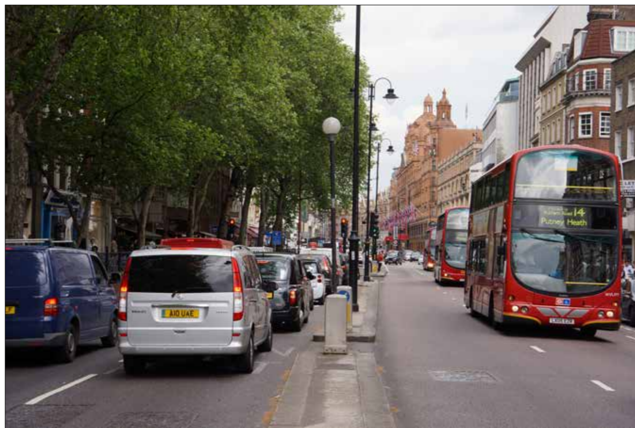
Buses on Brompton Road