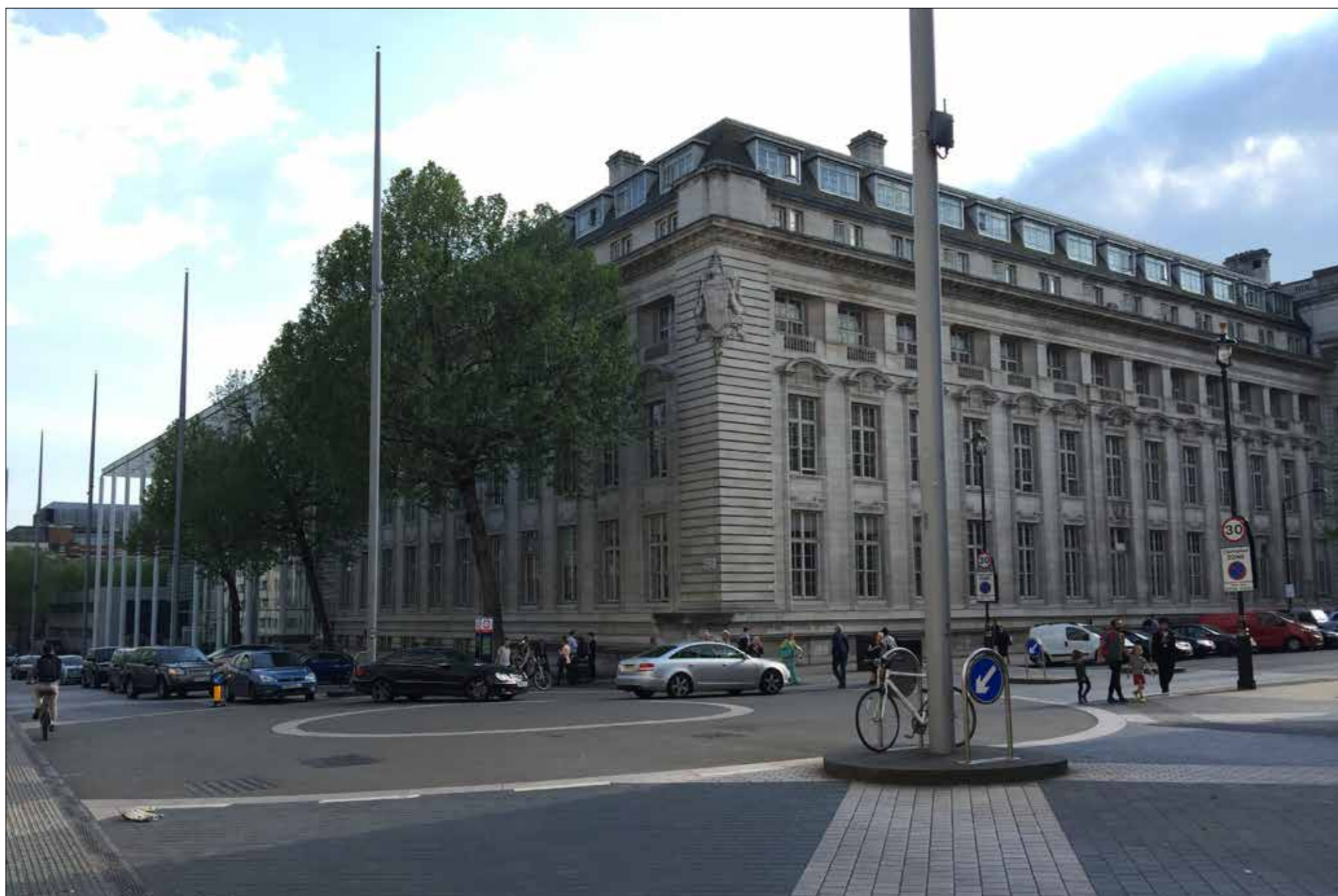
Exhibition Road impassable to pedestrians