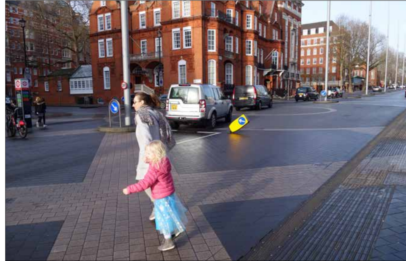
Pedestrians on Exhibition Road