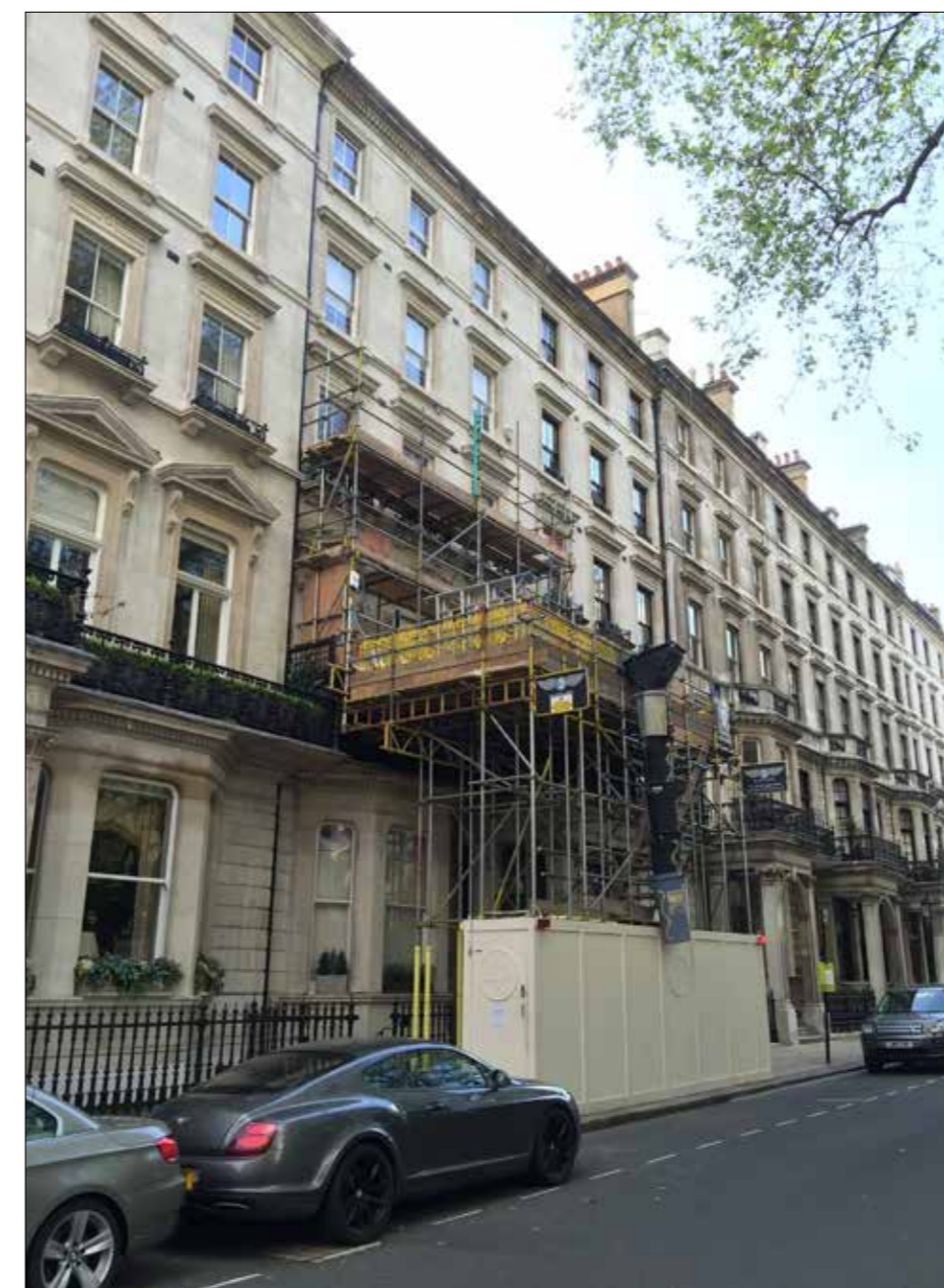
Scaffolding affecting amenity