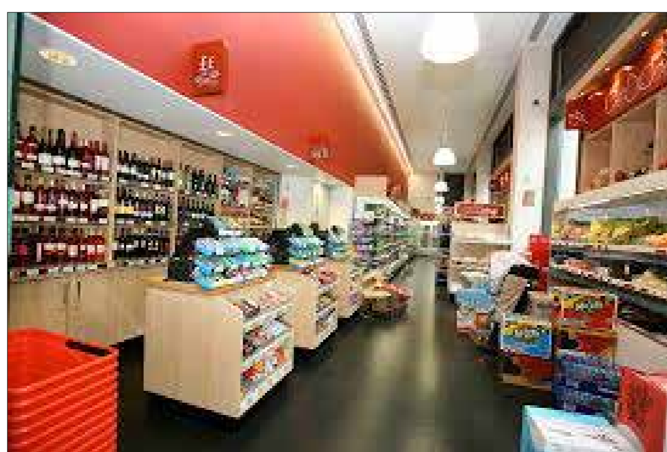
Essentials convenience store