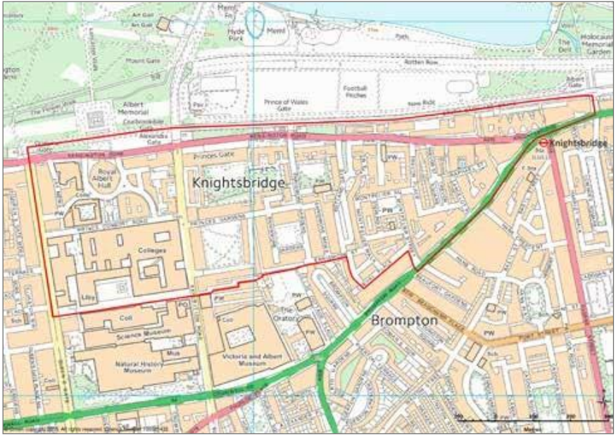
Figure 1: Knightsbridge Neighbourhood Area