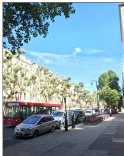
Potential to double cycle hire space near Imperial College London