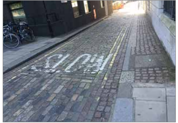
Road painting on cobbles should be consistent