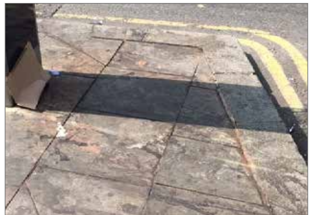
Examples of dirty pavement on corner of Brompton Road and Montpelier Street