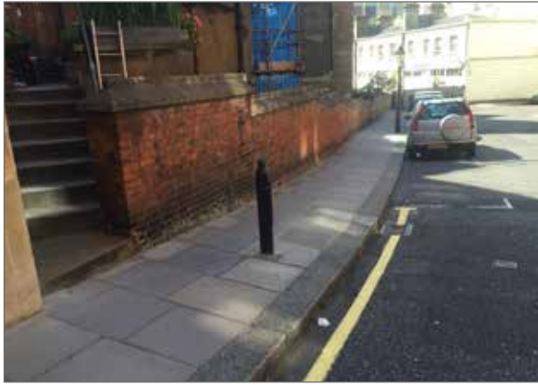
Old street light stump should be removed

2.5 The actions, along with the lead partners and proposed timescales are detailed in Appendix A. The Forum has also identified where these actions can contribute to the achievement of many of the 17 Sustainable Development Goals (SDGs) within the United Nations 2030 Agenda for Sustainable Development 1 .